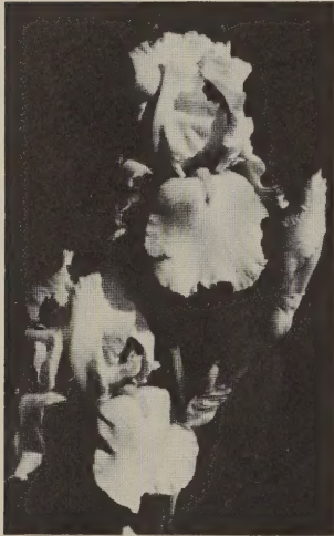
TRULY YOURS A ruffled yellow and white, edged with lace

The following brand-new varieties may be seen in our garden but our present stock is too low to offer any of them for sale in 1957: Al Borak, Altar Light, Apricot Supreme, Beechleaf, Big Ute, Black Castle, Bold Contrast, Briar Rose, Bright Contrast, Cadillac, Carmella, Centennial Queen, Congo, Constant Comment, Dark Chocolate, Dolly Varden, Enchantress, Escapade, Golden Alps, Hallmark, June Meredith, Kol Nidre, May Hall, Melodrama, Memories, New Adventure, Olympus Skies, On Parade, Pastella, Patience, Phoebus Apollo, Pink Fulfillment, Queen's Taste, Shiloh, Sierra Skies, Tabu, Thotmes III, Violet Grace, Wedding Bouquet, Whirlaway, Wings of Song.